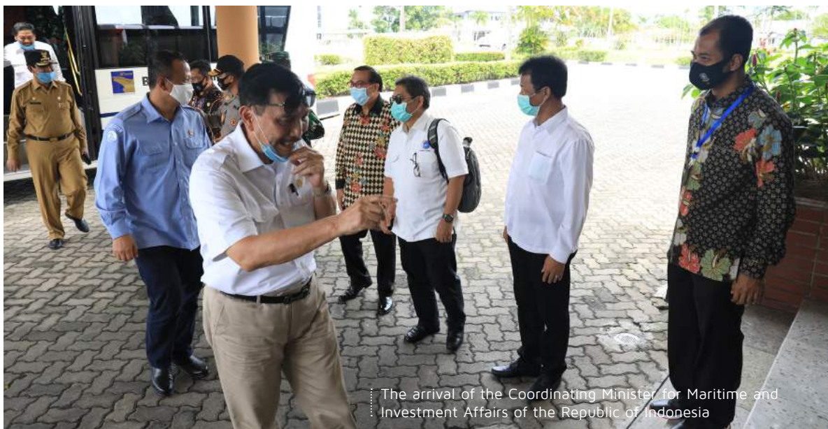
The arrival of the Coordinating Minister for Maritime and Investment Affairs of the Republic of Indonesia

With direct coordination from the Central Government, Batam is hoping all obstacles will be soon sorted out, to ensure the ease of doing business is being implemented in Batam.