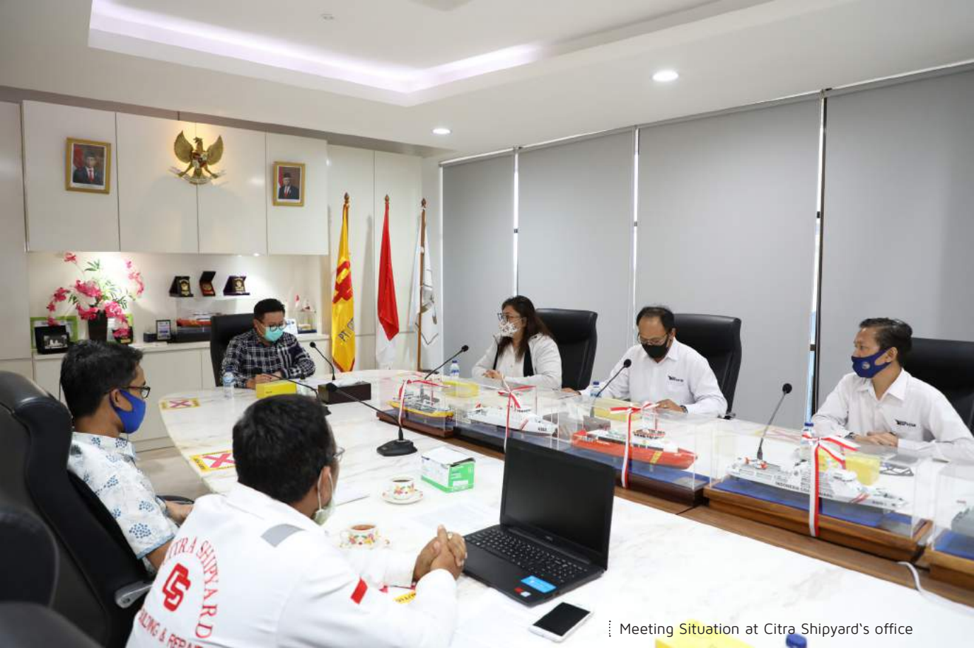
Meeting Situation at Citra Shipyard's office

related to financial issues, as some of the payments have been facing delayed on the process.