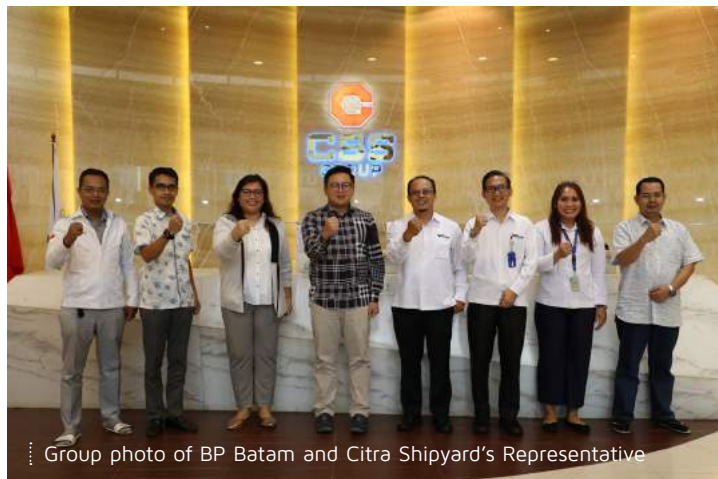
Group photo of BP Batam and Citra Shipyard's Representative

PT Citra Shipyard has been operating in Batam for more than 14 years, and has experienced many ups and downs of business. At the peak of the