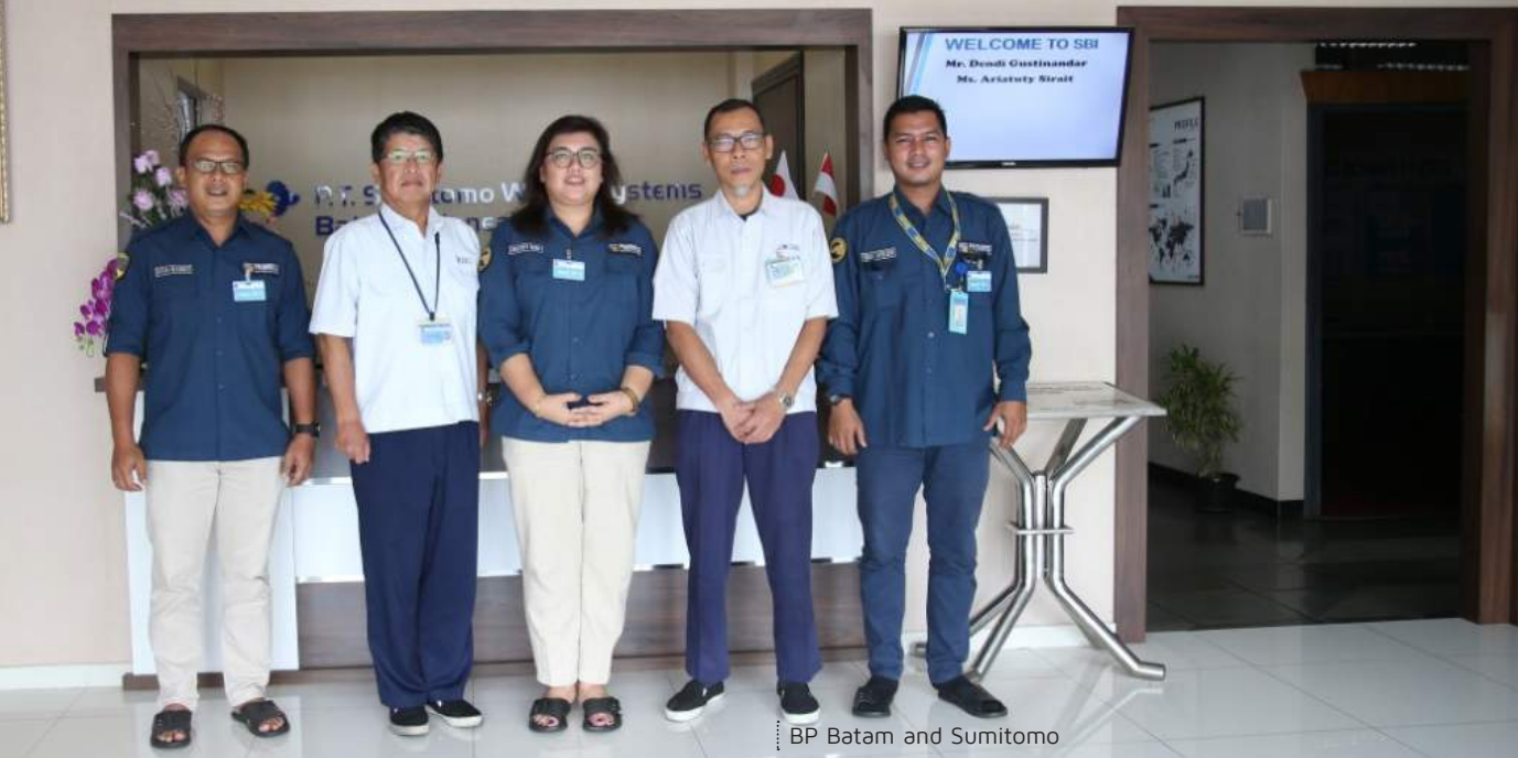
BP Batam and Sumitomo