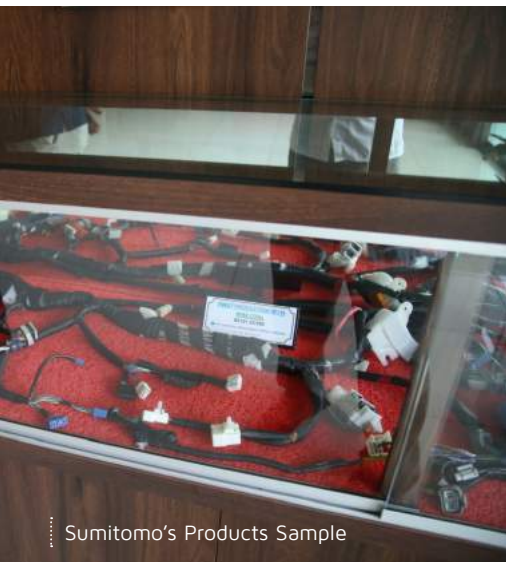
Sumitomo's Products Sample