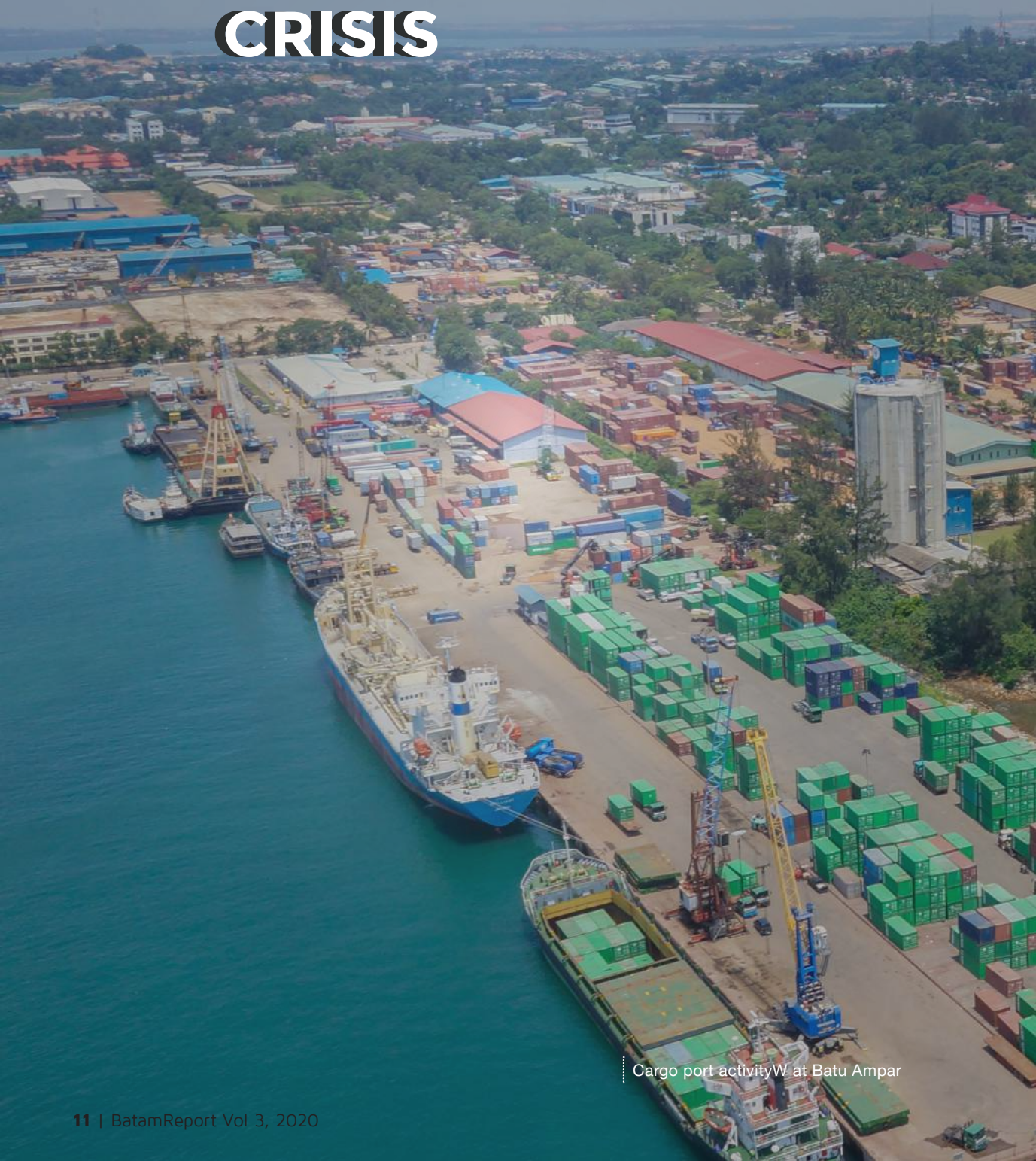
Cargo port activityW at Batu Ampar