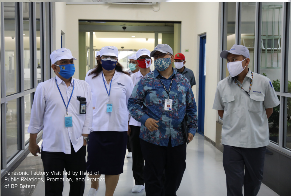
Panasonic Factory Visit led by Head of Public Relations, Promotion, and Protocol of BP Batam