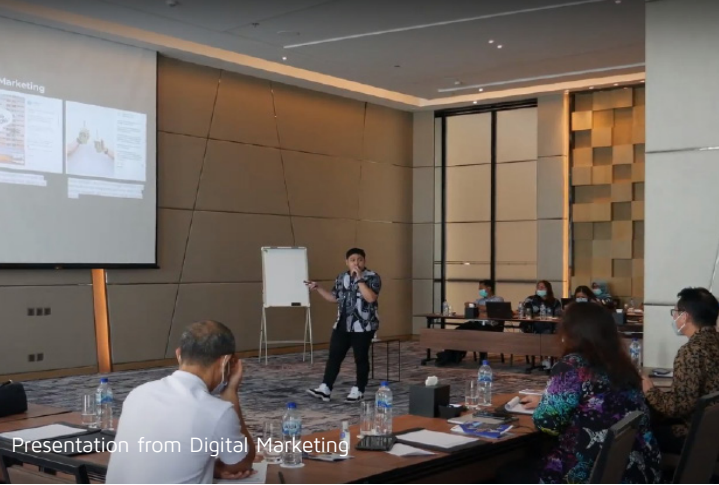
Presentation from Digital Marketing