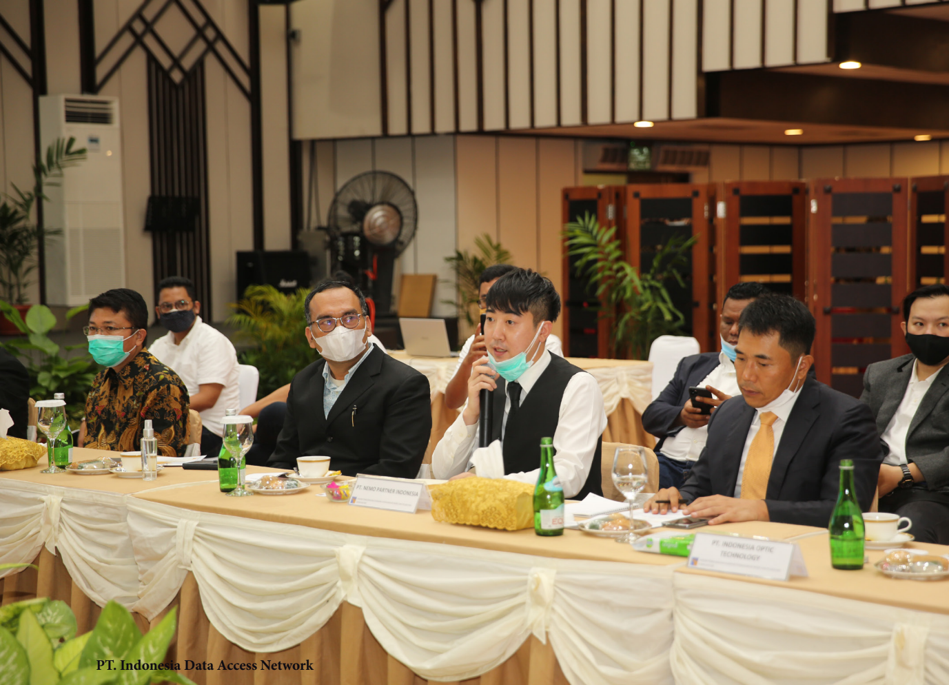
PT. Indonesia Data Access Network