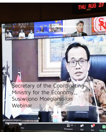
Secretary of the Coordinating Ministry for the Economy, Susi wijono Moegi arso on Webinar

Online discussion forum organized by BP Batam is followed among entrepreneurs, academics, and public, which discusses topics related to the readiness of Batam to face the industrialization and foreign investment, to formulate accurate steps for the government and businessmen to work together.