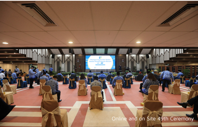
Online and on Site 49th Ceremony