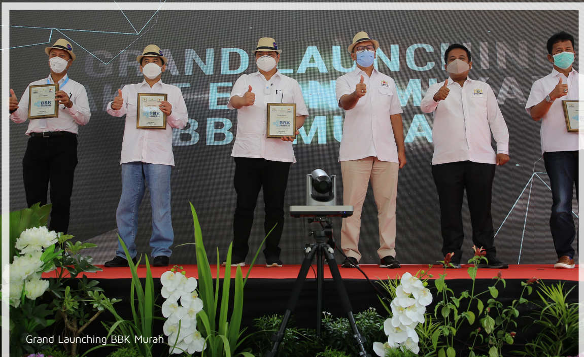
Grand Launching BBK Murah