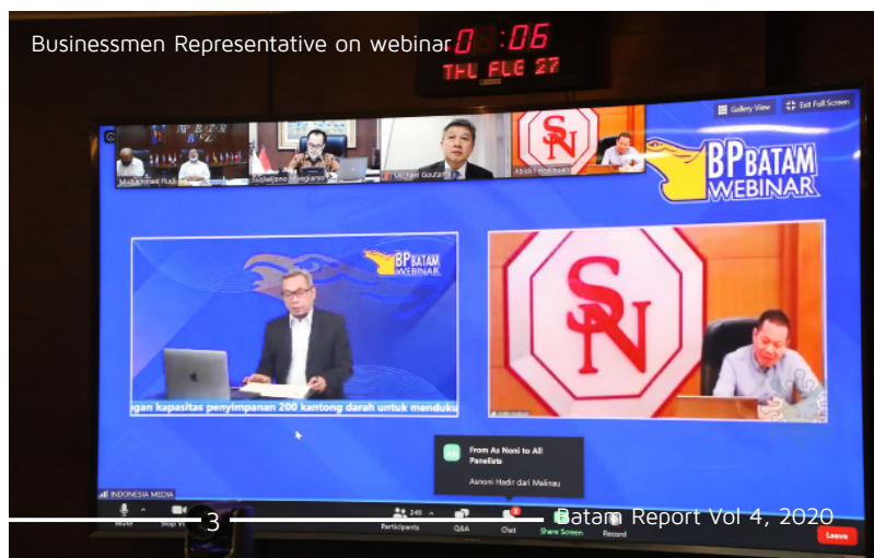
Businessmen Representative on webinar