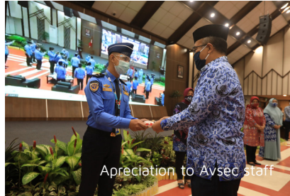
Appreciation to Avsec Staff