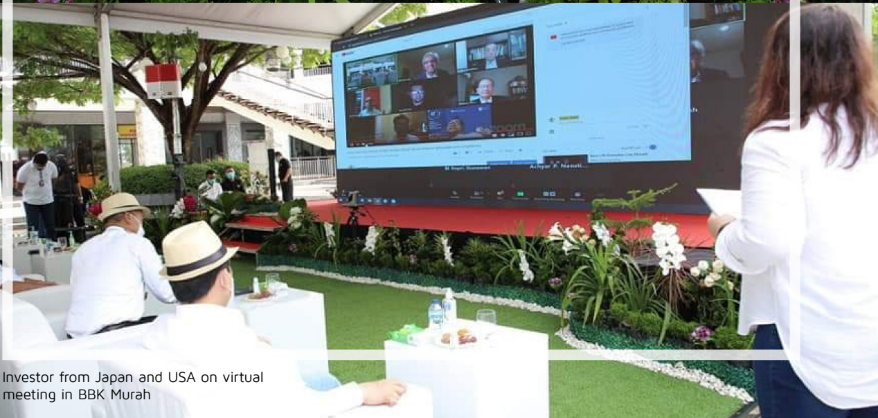
Investor from Japan and USA on virtual meeting in BBK Murah

who attended the Zoom Meeting is from the Racing Car, Autoban and IT Cyber Security industry. Even though the Covid-19 pandemic is a new challenge in the world economy, with the inauguration of BBK Murah activities along with Zoom Meeting with