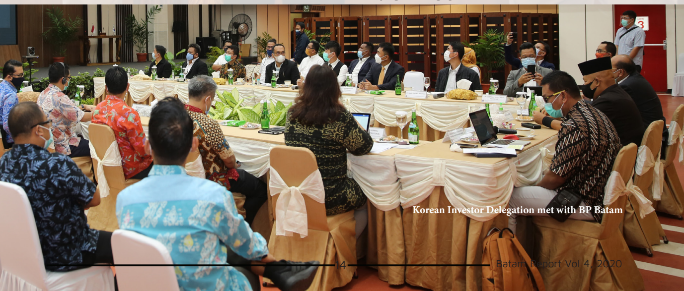
Korean Investor Delegation met with BP Batam