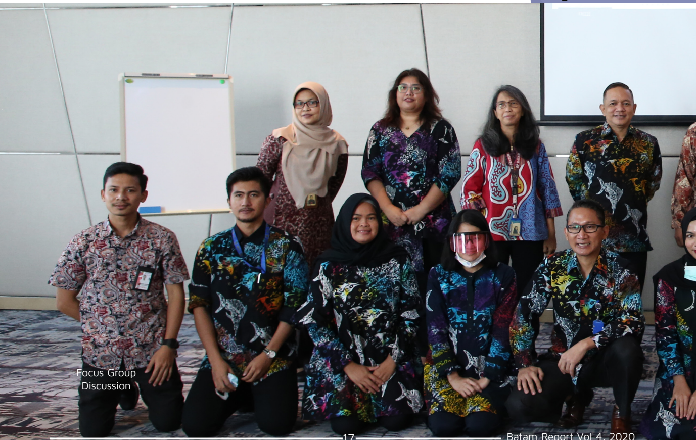
Focus Group Discussion