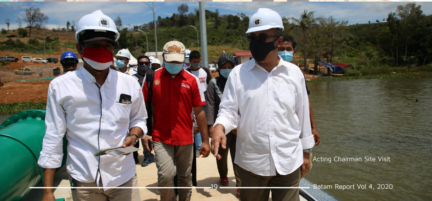
Acting Chairman Site Visit

clean water capacity will continue to increase and the service will be even better in the future. With the operation of Tembesi Reservoir, water supply in Batam is more than enough. Batam does not have natural resources for water, therefore it relies more on the rainfall which need man made reservoirs for water supply, both for the people and the industries as well. BP Batam will continue to add more in 2024 water, as water will become one of the priorities in the development program for the near future