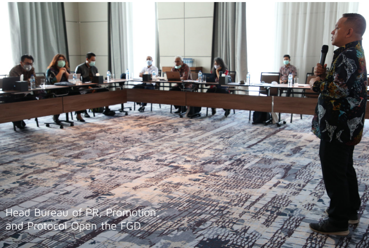
Head Bureau of PR, Promotion, and Protocol Open the FGD

On 12 – 13 November 2020, the Promotion division held a Focus Group Discussion on formulating promotional strategies within the Strategic Business Units of Badan Pengusahaan Batam (BP Batam) at Marriott Hotel. The strategic business units comprised of Airport, Seaport, Hospital, Information System, Water and Waste Water and Assets of BP Batam.