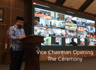
Vice Chairman Opening The Ceremony