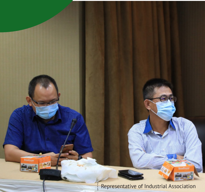
Representative of Industrial Association

The procedures must be done to ensure the protocols and also to minimize the COVID-19 virus infection in both regions despite the close relations in businesses and social activities between Batam and Singapore.