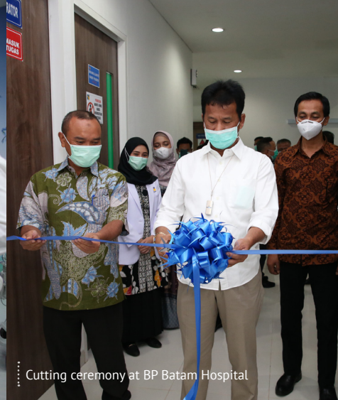
..... Cutting ceremony at BP Batam Hospital