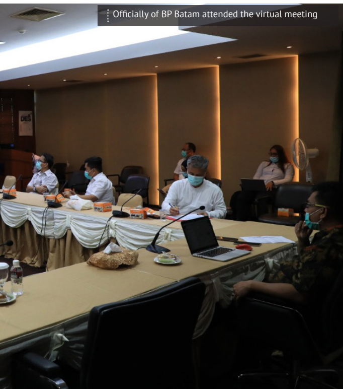
Officially of BP Batam attended the virtual meeting