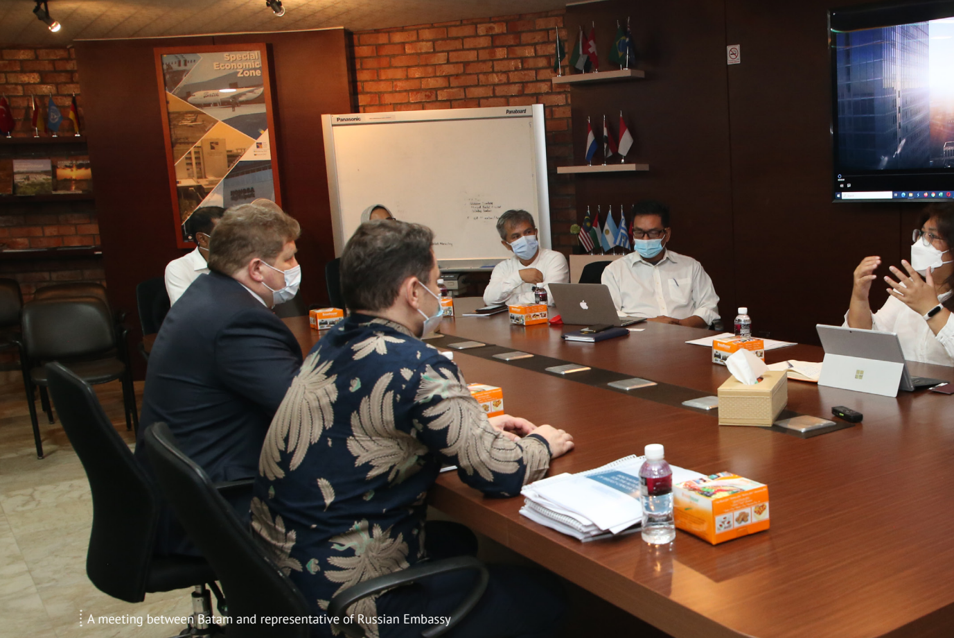
A meeting between Batam and representative of Russian Embassy