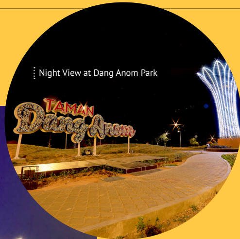
..... Night View at Dang Anom Park