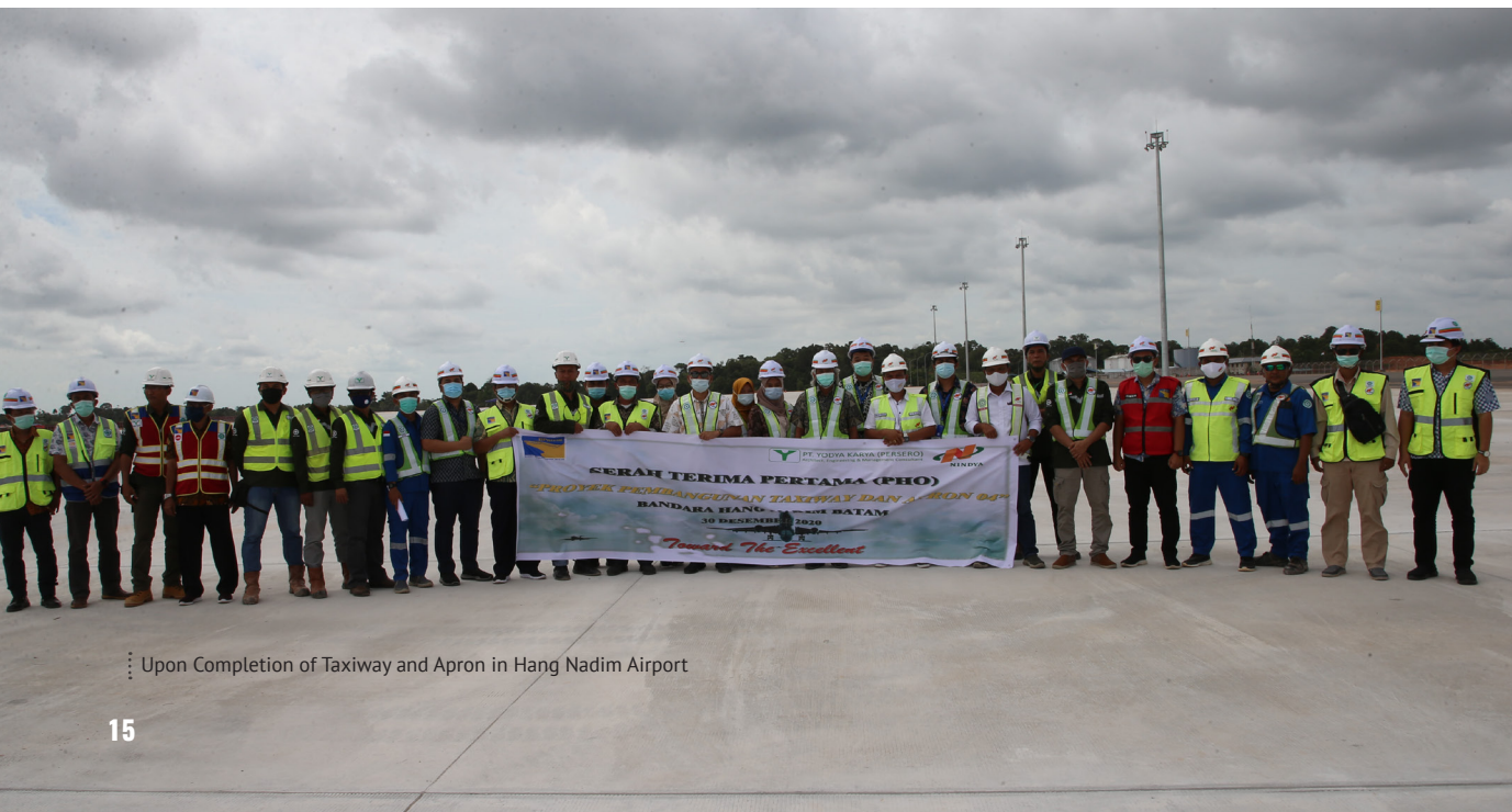
Upon Completion of Taxiway and Apron in Hang Nadim Airport

With this facility, Batam will cease to increase its competitiveness with other similar regions as well as attracting new investors in the near future. BP Batam has prioritized for infrastructures development to support investment and economic growth. The existing foreign investment in December 2020 has reached to 77 Million USD with 438 Projects during the pandemic.