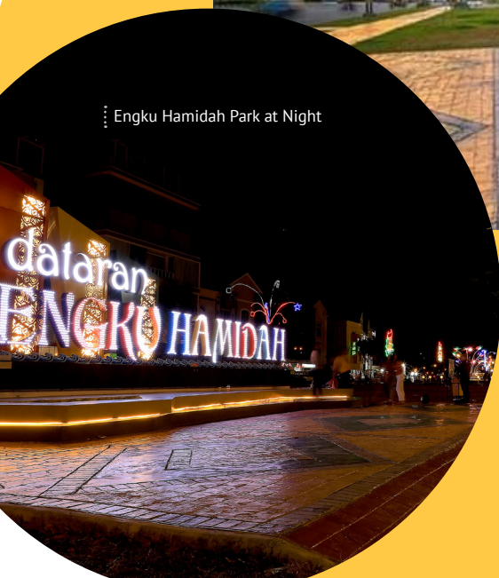
..... Engku Hamidah Park at Night