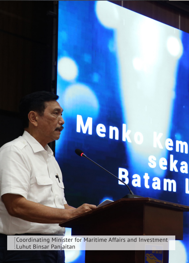
Coordinating Minister for Maritime Affairs and Investment Luhut Binsar Panjaitan