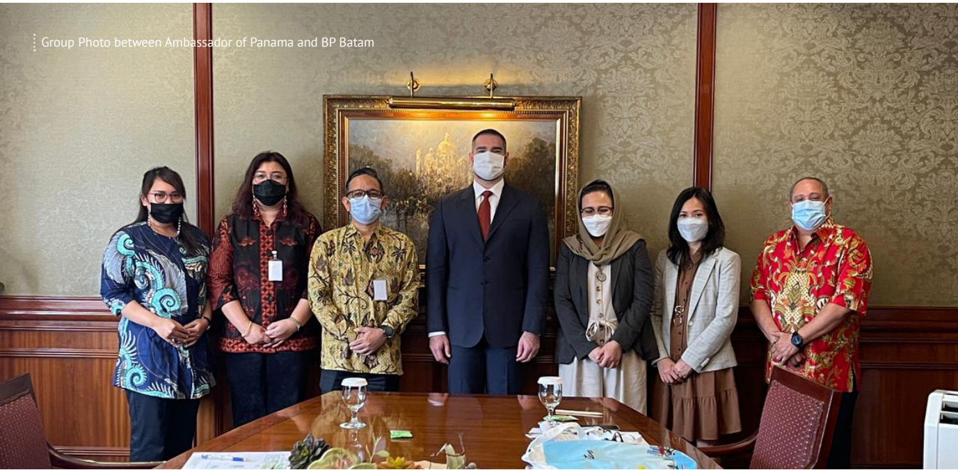
Group Photo between Ambassador of Panama and BP Batam