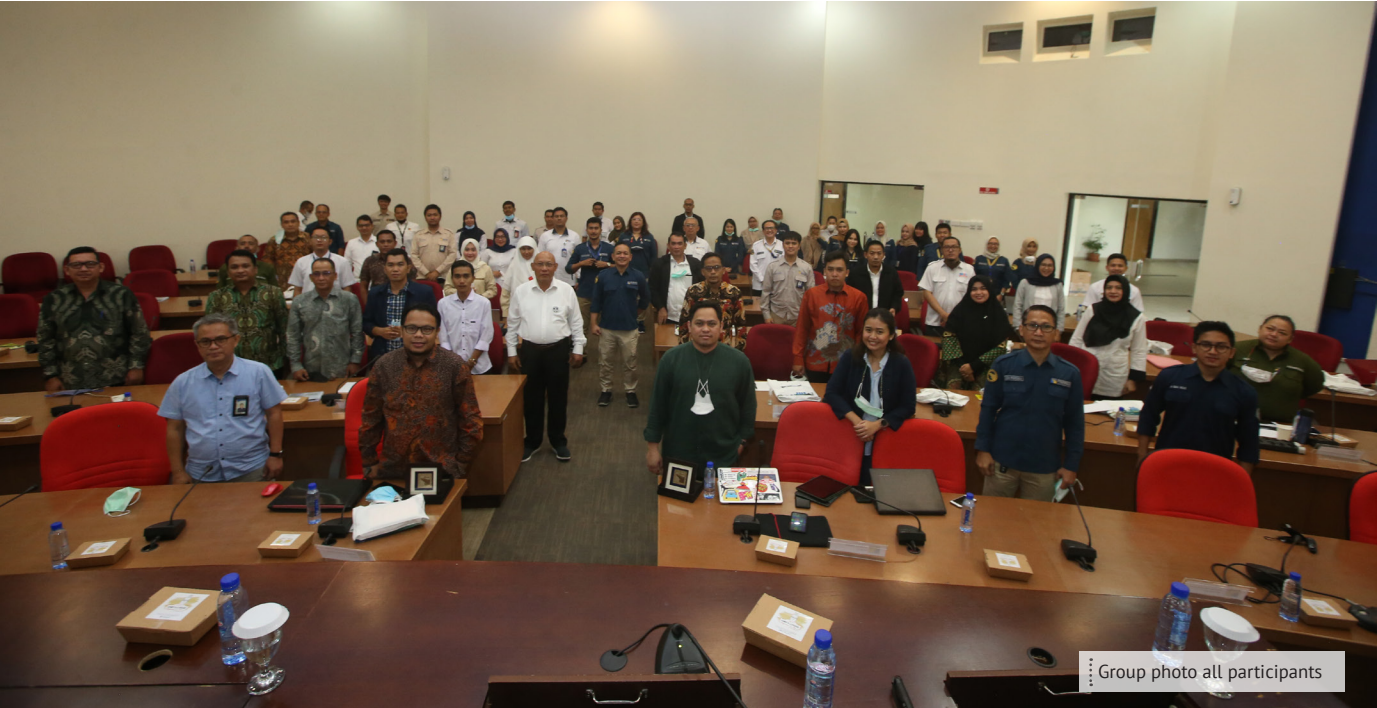
Group photo all participants