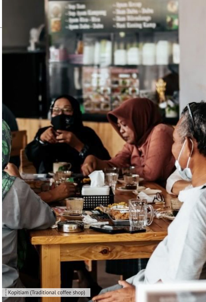
Kopitiam (Traditional coffee shop)

At this time there are many famous coffee places in Batam as businesses