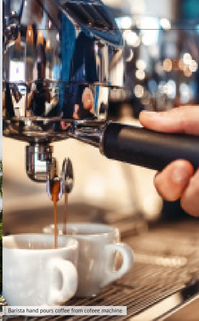
Anchor's cafe and roastery