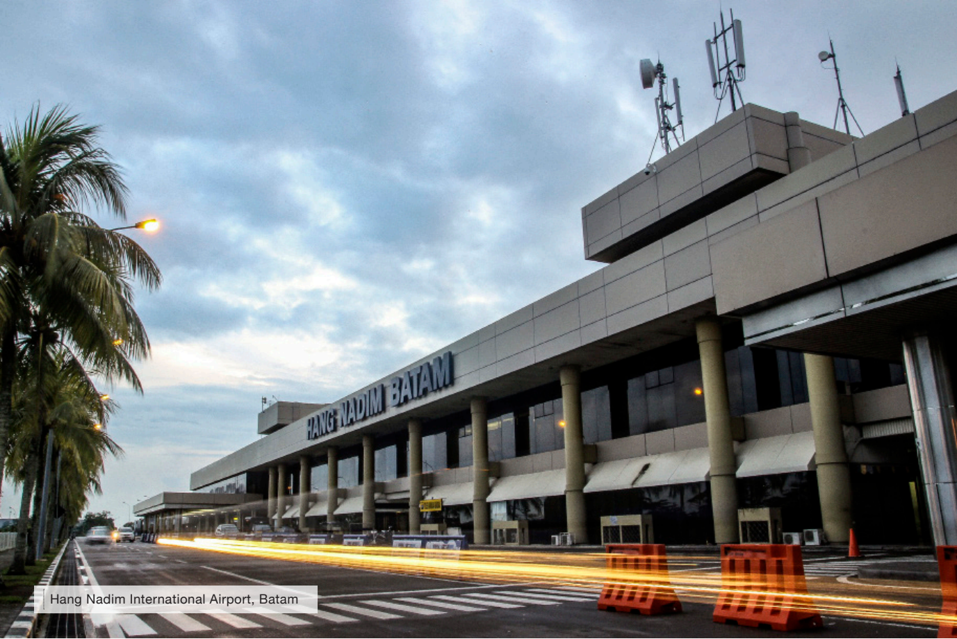
Hang Nadim International Airport, Batam