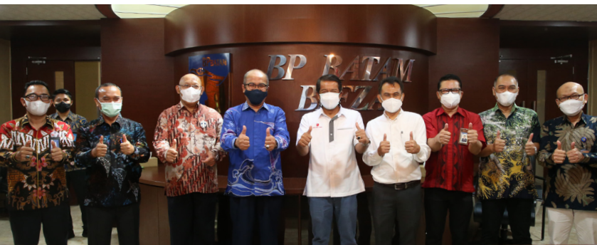
BAT & BP Batam

MRO BAT as Special Economic Zone (SEZ) will save the country's foreign exchange up to 65-70% of the MRO needs of national airlines worth 26 Trillion IDR annually or the equivalent of 1.8 Billion USD, where all this time has been spent abroad. This area will employ 9,976 workers and expected to be able to seize opportunities from the Asia Pacific market which has around 12,000 aircraft units and a business value of 100 Billion USD by 2025. (FD)