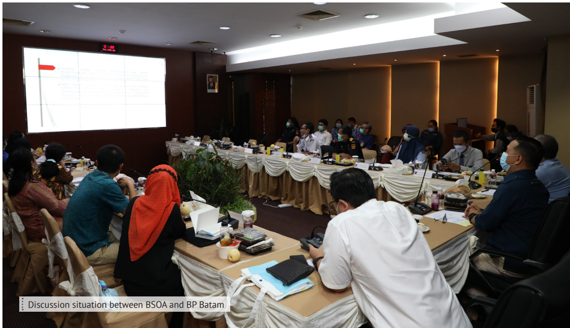
Discussion situation between BSOA and BP Batam

Despite the pandemic era, demand for ship repair from Singapore is still high and continues to rise. Immigration is indeed a lockdown in Singapore and Batam can take advantage of projects that should be carried out in Singapore to increase the economic in Batam. (NC)