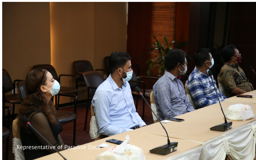
Representative of Paradise Dates from Tunisia