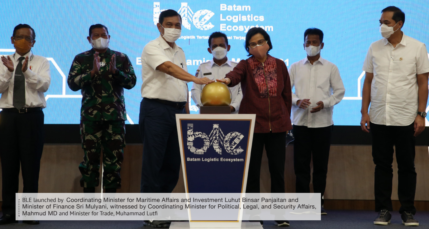
BLE launched by Coordinating Minister for Maritime Affairs and Investment Luhut Binsar Panjaitan and Minister of Finance Sri Mulyani, witnessed by Coordinating Minister for Political, Legal, and Security Affairs, Mahmud MD and Minister for Trade, Muhammad Lutfi