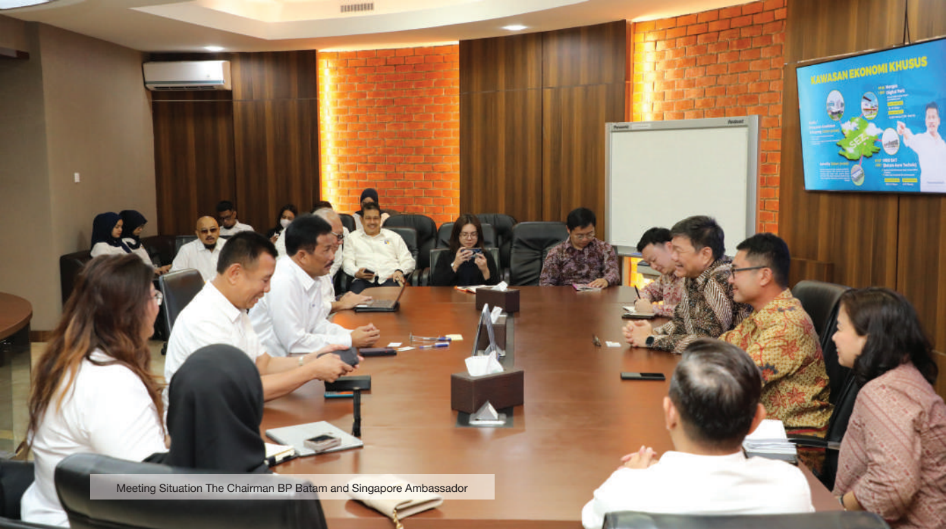
Meeting Situation The Chairman BP Batam and Singapore Ambassador