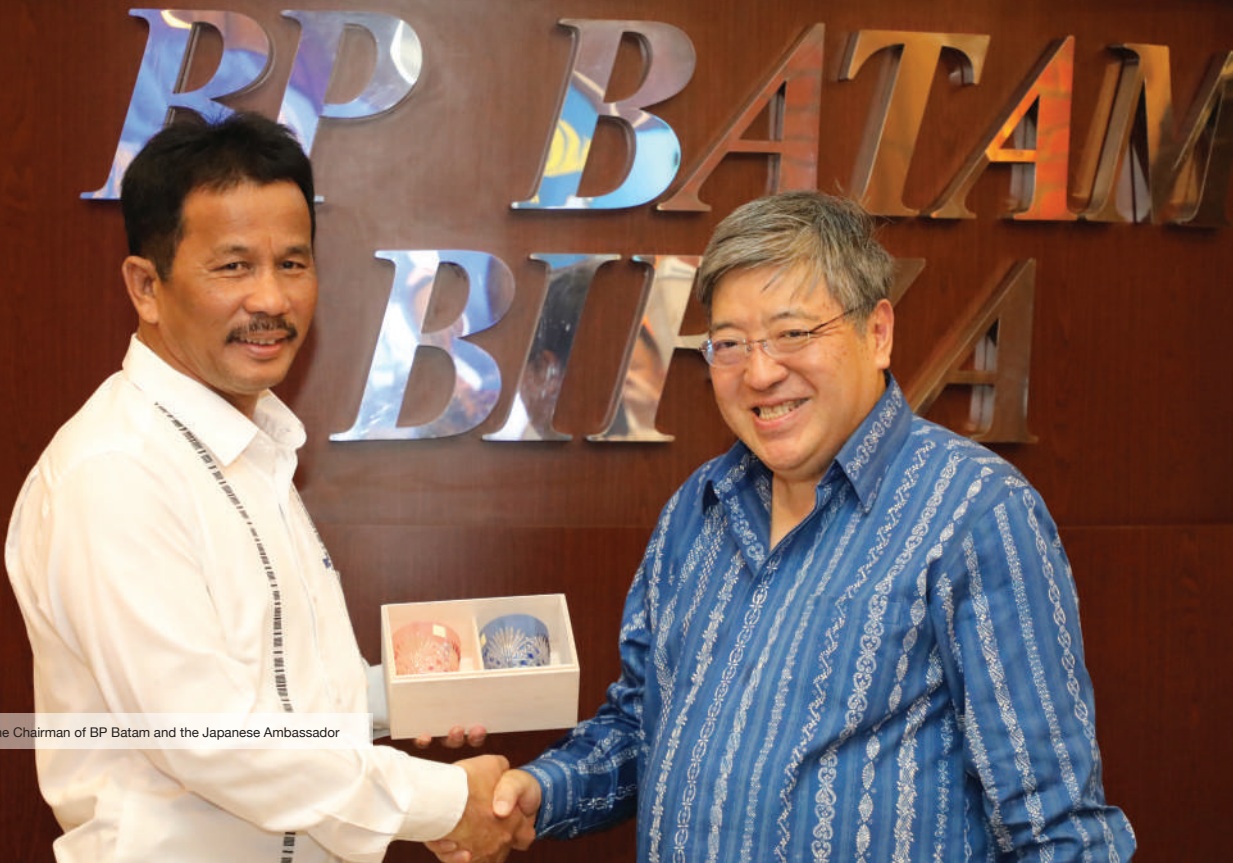
The Chairman of BP Batam and the Japanese Ambassador

BP Batam will persist in focusing on all aspects of investment interest, including expanding road connectivity and constructing ports and airports which will make it easier for people to travel to and from Batam.