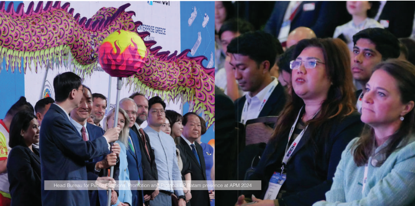
Head Bureau for Public Relations, Promotion and Protocol BP Batam presence at APM 2024

B P Batam prioritizes the maritime industry's development, recognizing its significance in the national economy due to its labor, capital, and technology-intensive nature. To bolster Batam's maritime sector, BP Batam participated in the Asia Pacific Maritime (APM) 2024 exhibition in Singapore, featuring 700 participants and 1,400 brands showcasing innovative solutions.