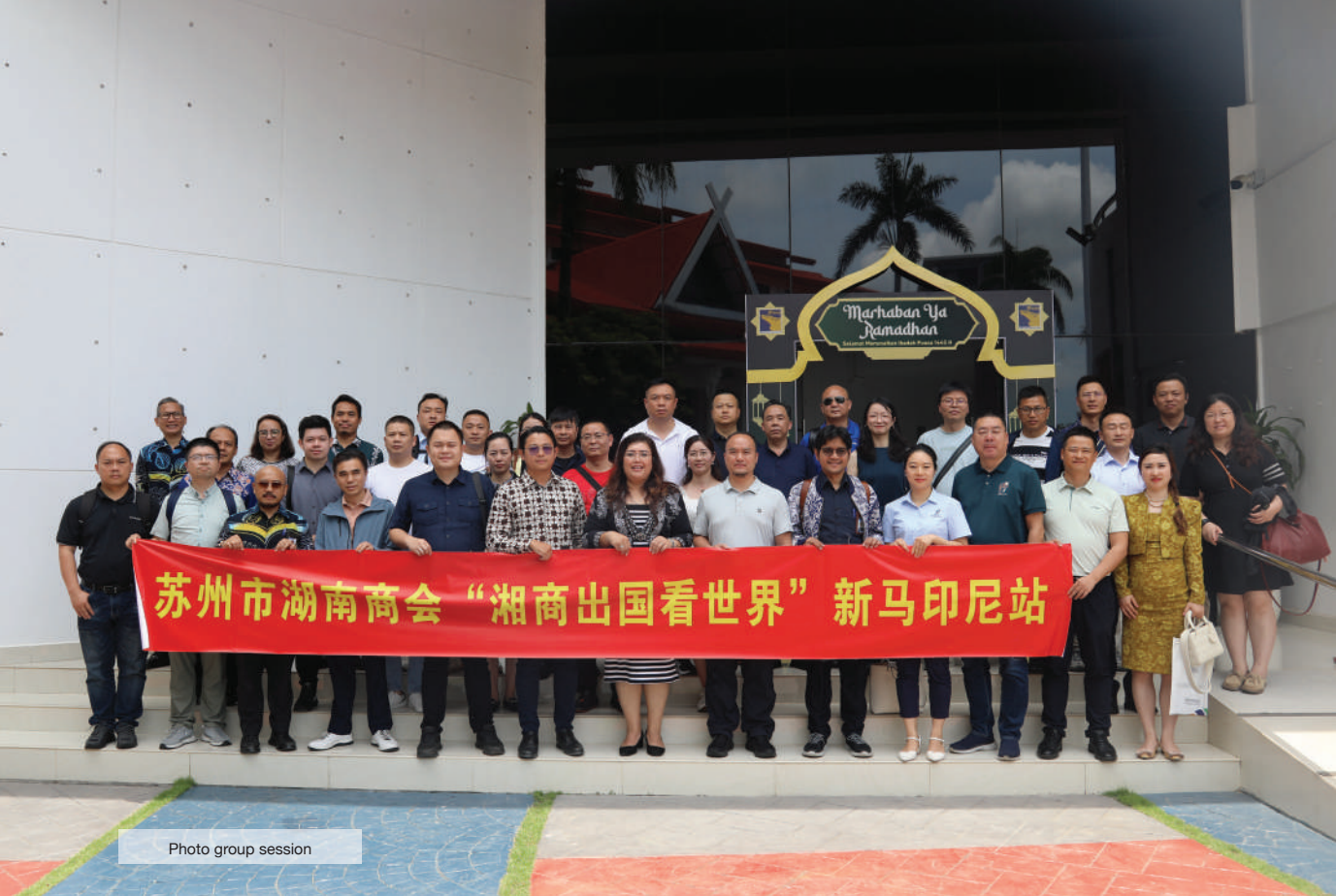
Photo group session