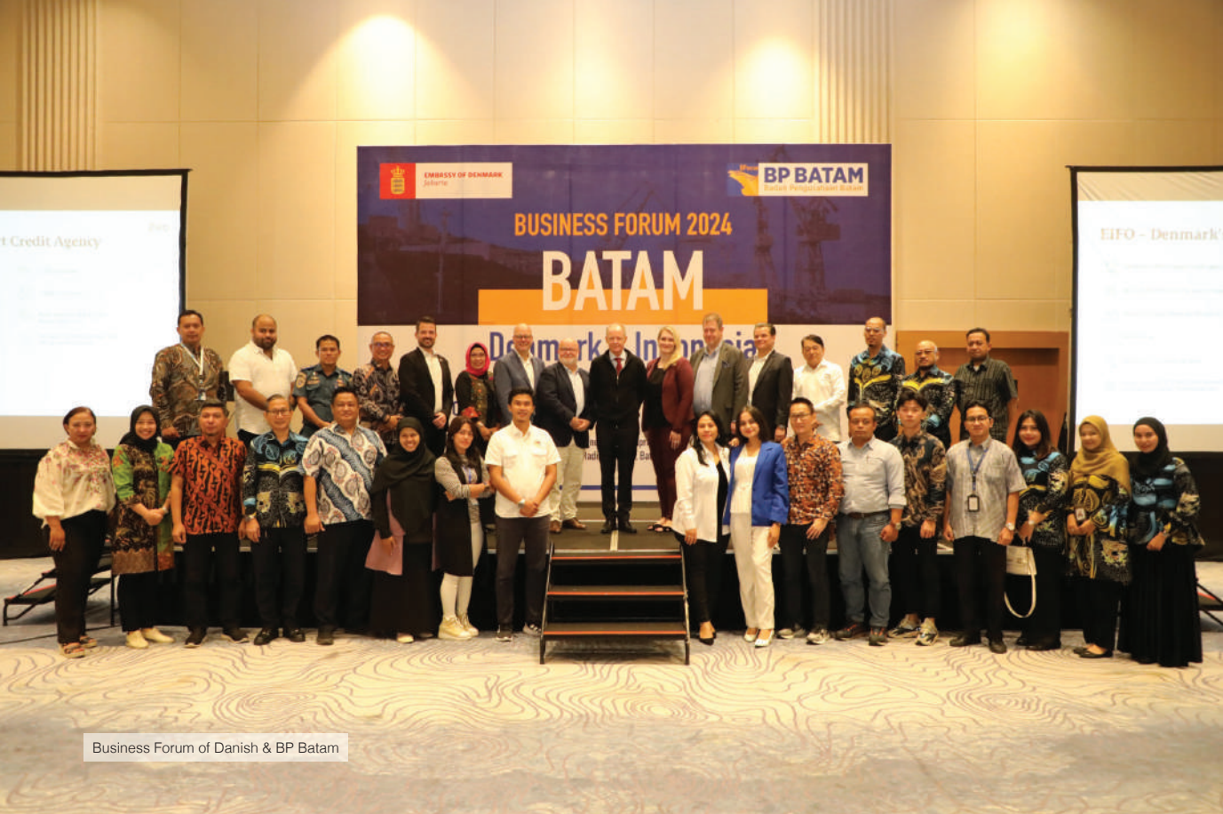
Business Forum of Danish & BP Batam