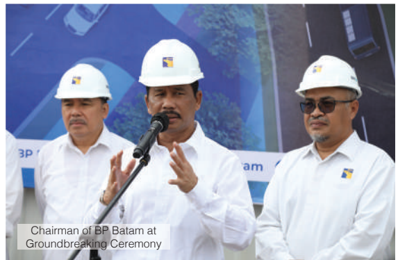
Chairman of BP Batam at Groundbreaking Ceremony