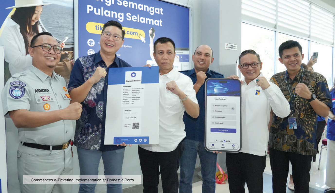
Commences e-Ticketing Implementation at Domestic Ports