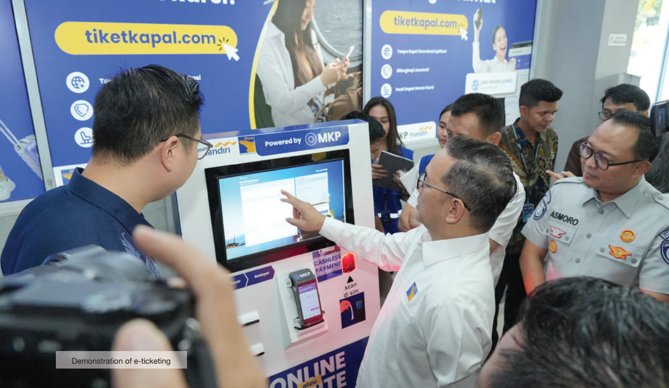
Demonstration of e-ticketing

peak travel season), etc. In addition, travellers can instantly scan their boarding cards after making a payment.